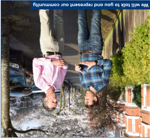
We will talk to you and represent our community

3 IMPROVE LOCAL TRANSPORT LTN camera fines in Dulwich have raised £7m to date. These should be reinvested here, including in local public transport. We will campaign to introduce a zero-emissions community bus, more electric vehicle charging points and bike storage - these, not road blocks, are solutions to sustainably reduce pollution and traffic.