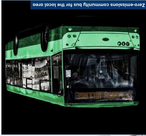
Zero-emissions community bus for the local area