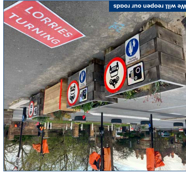
We will reopen our roads

2 GIVE RESIDENTS A VOICE Residents, local businesses and grassroots community groups will be our priority. Councillor candidates from other political parties are under pressure to take their party line in Southwark and can't represent you effectively. We can't represent you effectively. We know and understand Dulwich and will make sure your voice is heard.